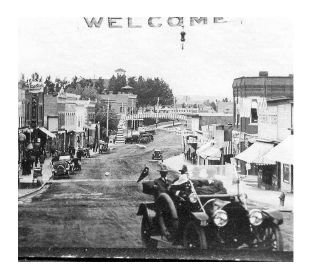
Buffalo Historic Main Street Walking Tour